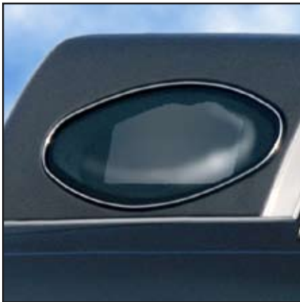
An optional oval window is also available.