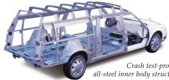
Crash test-proven, all-steel inner body structure.