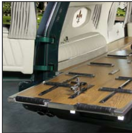
Rear power extend table opens and closes with the push of a button on the rear loading door frame.