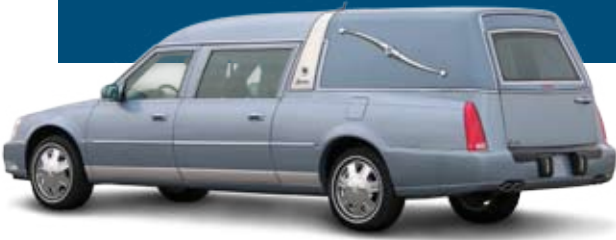
◀ Shown with optional Crown package.