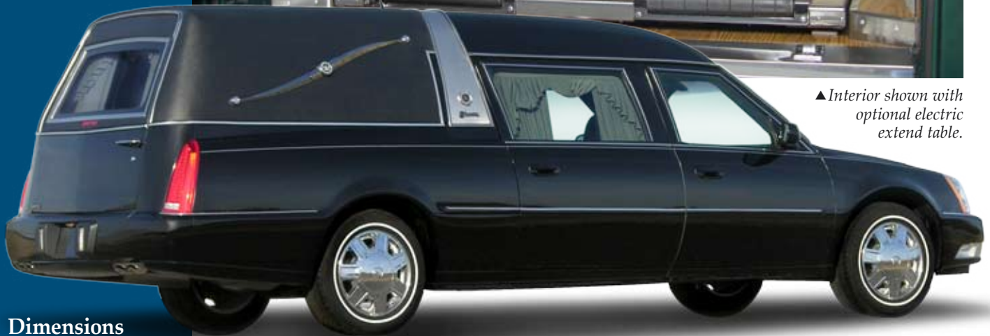
▼ Shown with optional Crown package.