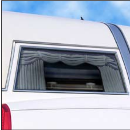
An oval or limousine-style window can add an additional touch of elegance.