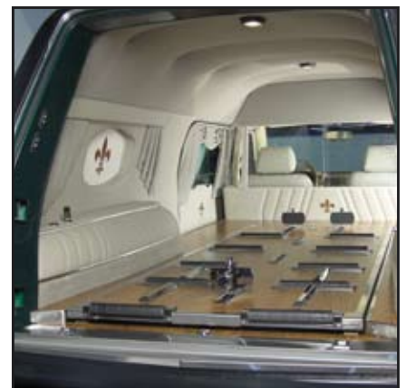
Deluxe cloth headliner with two headliner lamps and optional power extend table.