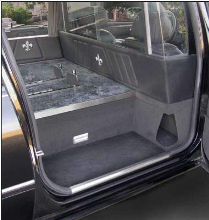
Extra-large storage compartment under partition with lid.