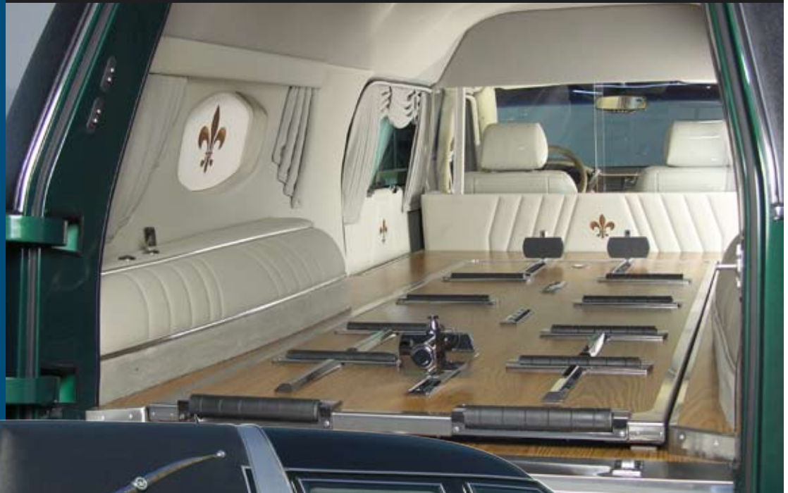
▲ Interior shown with optional electric extend table.

Our Cadillac Sovereign combines the superior performance you need with the elegant, traditional appearance you want. All-steel doors, including the loading door, provide exemplary fit, finish and durability. The Sovereign's commercial glass styling creates a coach of timeless dignity.