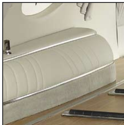
Stylized wheelhouse panels, with brushed aluminum accent moldings, are shaped to yield more floor space to carry additional flowers.